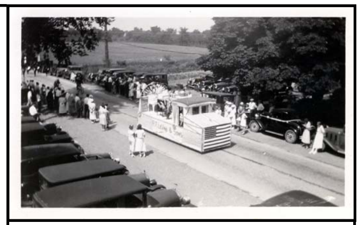
Float in Sanborn Fire Company Parade

Our home was only a short block from the RR tracks. Once in a while we would hear a light knock at our front door. It would be a hobo riding the rails looking for food. My Mom always seemed to have a little extra food that she gave them. found out later that hobos passed the word around where they could expect to receive a hand-out if needed. Doubt if anyone would open the door to a shabby stranger in these alone.