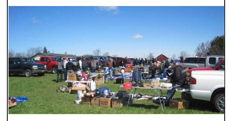
Rods & Customs Swap Meet at the farm.

We had a great turn out for the Rods & Customs Swap Meet with many visiting our museum. Our profit of $1860 including $920 from club. They want to come back!