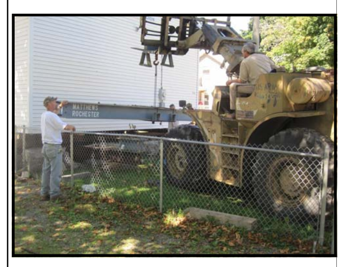
Putting the front tie beam in place

LEGION BUILDING MOVE- The 56'x25' Legion Building is well on its way if not all ready moved at the time you read this newsletter. The plot plan and necessary county and town planning board approvals have been received and the Matthew House Movers of Rochester are under contract ($65,000) for the