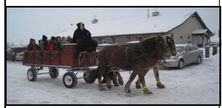
Nothing like a wagon ride by horses

THERE IS NO ADMISSION FEE SO COME OUT WITH THE KIDS & HAVE A VERY MERRY CHRISTMAS AT THE FARM.