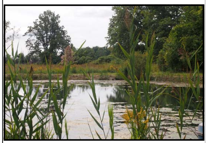
Pond at the Farm

The tall spiky-looking reeds in the foreground in the photo are phragmites, (invasive reeds). You can find them growing in just about every ditch along country roads and expressways.