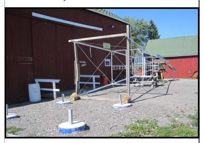
50' Windmill ready to be erected

The windmill formerly located on the Wendt farm has been donated by the Wendt family as a memorial to Ken Wendt , a founding member of SAHS. The windmill has been refurbished with the head now attached to the main frame. As shown in the photo the 18" piers with the 4' long support brackets are ready for erecting the 50' windmill into place.