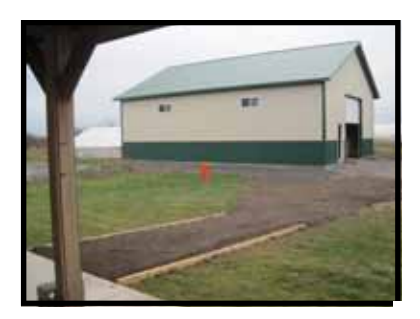
Storage Bldg- 2015