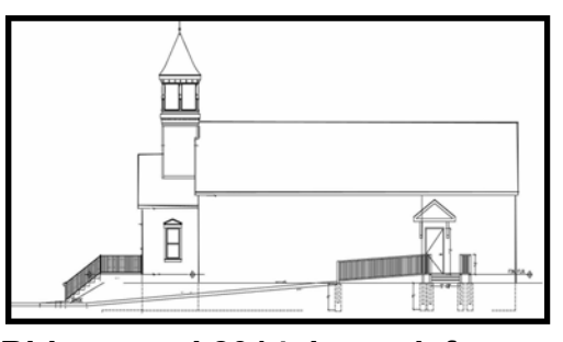
Legion Bldg moved 2014, in-work for modification