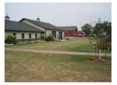
Read Memorial Bldg-2012