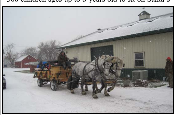
We had our snow and horse drawn wagon rides