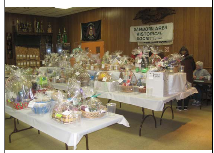
Don't forget our Antique Sale & Basket Auction April 1 and 2, 2017

The Antique Show and Sale will take place April 1 & 2, 2017 at the Wheatfield American Legion Post #1451, 6525 Ward Rd. (Rt. 429) in Wheatfield. The event will be held 9 AM to 4 PM on Saturday and 10 AM to 4 PM on Sunday. A Basket Auction will run concurrent with the Antique Show and Sale