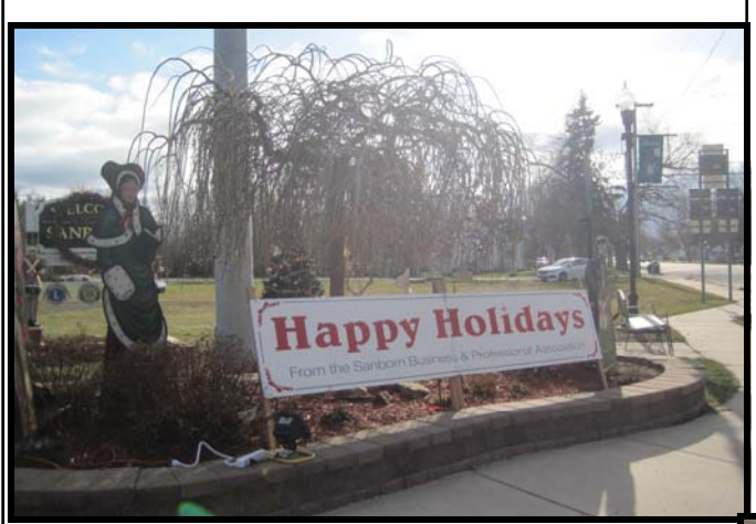
Have a healthy 2017

The SB&PA held another great Autumn Fest in Sanborn at the farm in October with SAHS having the food concession. This brought in many visitors to our Farm Museum. They also had a fine Christmas display on the corner of Rte 31 & 429. New this year, the SB&PA hosted