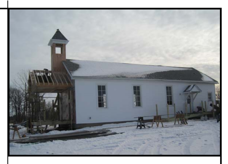
Legion/Church Building is taking shape

This summer SAHS will have the grading completed so that Jay can install the steps for the front entrance and complete the siding on the north end of