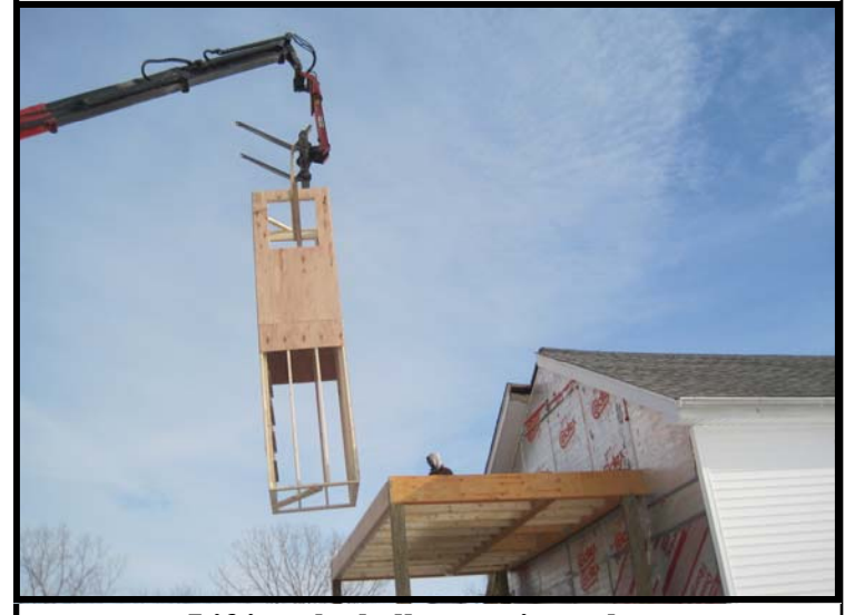
Lifting the bell tower into place

Jay Wendt Construction had the east, south and west siding installed building and is well underway to finishing the north porch with bell tower and the short ramp and deck for handicap entrance to the side door.