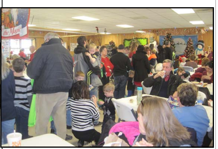
Join the crowd next year!