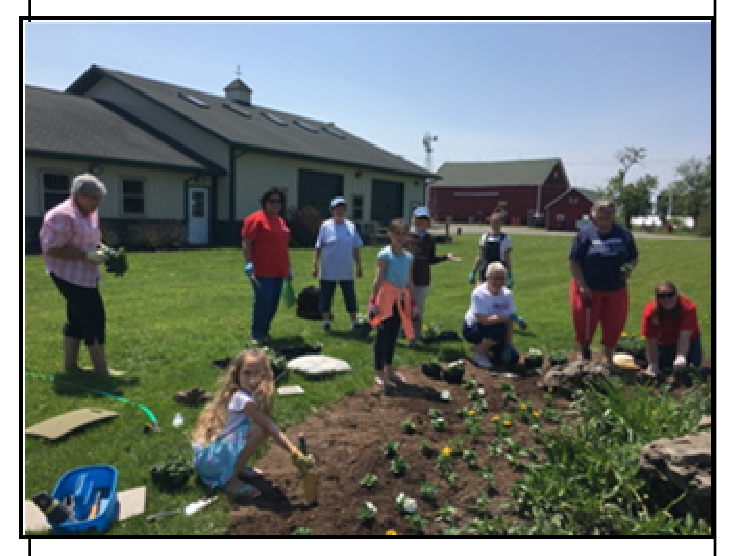
Garden Committee

Our annual beds overflow with brilliant color every summer, and this year will be no exception. At the end of May the Garden Committee