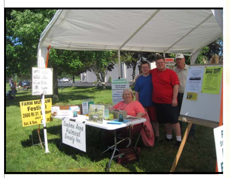
SASH Set at Market in the Country

This event sponsored by the Rotary and Lions Clubs replaced Old Sanborn Days this year. The one day event was held on June 8 at the Lions Club Park on Ward Road next to the Wheatfield Legion Post. SAHS had a 10' x 20' tent, housing an assortment of artifacts and our literature. This first year event should be better next year with some of the kinks worked out and mother nature providing a dry field to set up our exhibits.