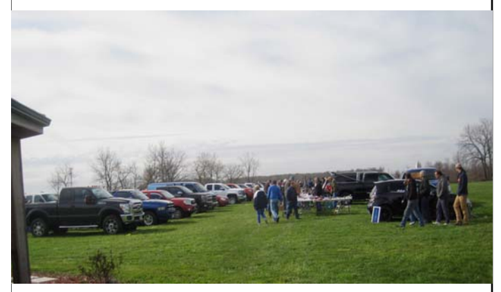
Car Parts Swap Meet at the Farm

The weather was beautiful for our 6th year of hosting the Rods & Customs Car Parts Swap Meet. Vendors for this event keep growing and buyers fill our parking lot and other areas as well. Our food concession group did an excellent job keeping up with customers. We showed a profit of $1332. We also had many visiting our Farm Museum. Great job one and all!