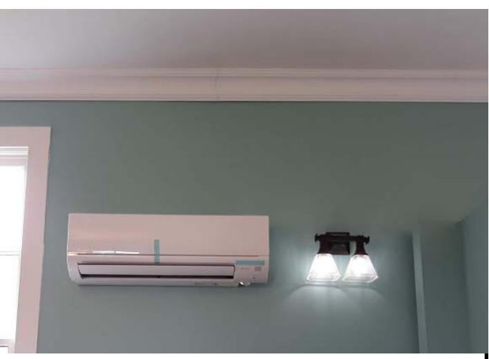
Duckless Heating Unit