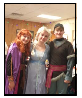
Anna, Elsa and Kusstoff from Frozen