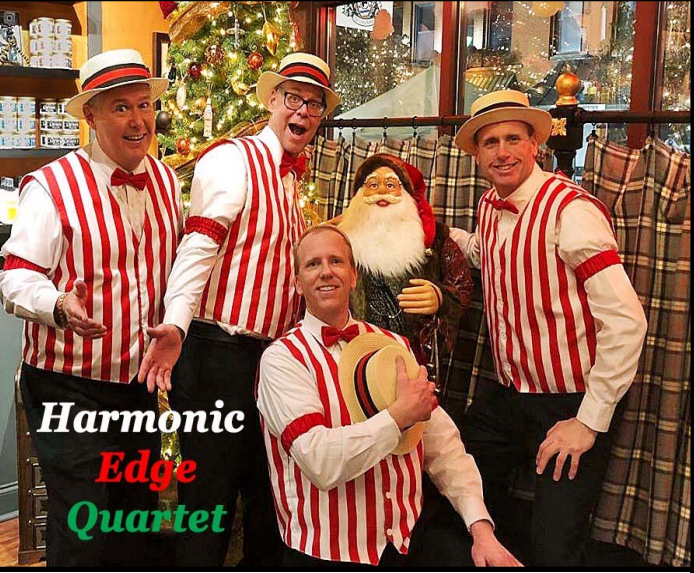
Fine Music by the Harmonic Edge Quartet

The SB&PA held another great Autumn Fest in Sanborn at the farm in October with SAHS having the food concession. This brought in many visitors to our Farm Museum. They also had a fine Christmas display on the corner of Rte 31 & 429 for the season. The SB&PA hosted a community Christmas Carol Sing-a-long and