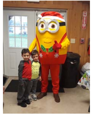
The Christmas Minion