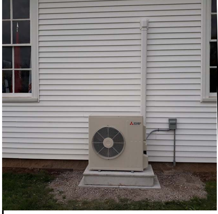
Air Conditioner out side the Treichler Building

The work had to be stopped for a few days to allow an exterminator to eliminate the large nest of bees in the crawl space.