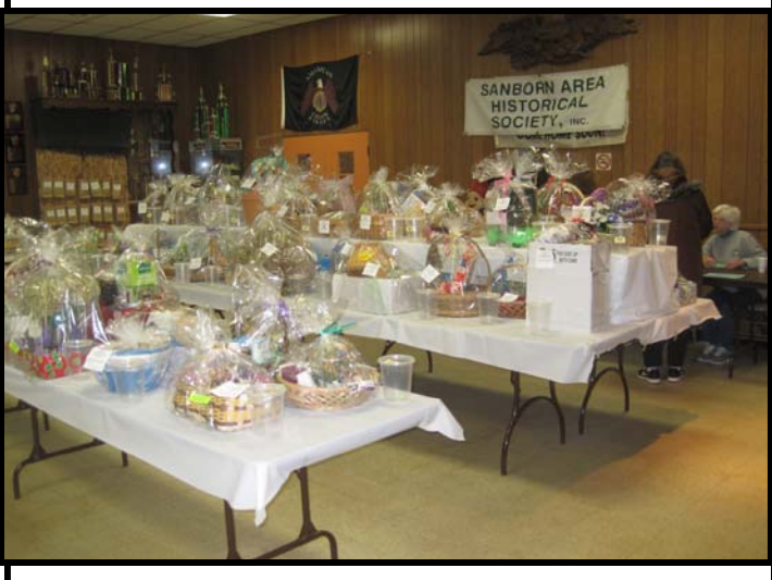
Antique Show with Basket Auction now at Farm

The Antique Show and Sale will take place April 4 & 5, 2020 in the Townsend Hall at the farm. The event will be held 9 AM to 4 PM on Saturday and 10 AM to 4 PM on Sunday. A Basket Auction will run concurrent with the Antique Show and Sale with the drawing to take place on Sunday at 4 PM.