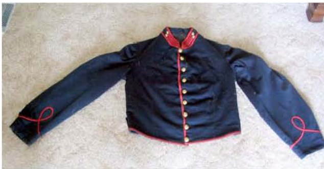
MABON'S FIELD JACKET