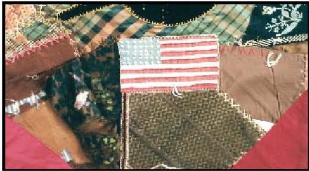
38 STAR AMERICAN FLAG