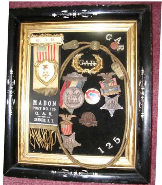
G.A.R. RIBBONS & METALS On display at the Sanborn Area Historical Society as donated by Sanborn American Legion Post No. 969